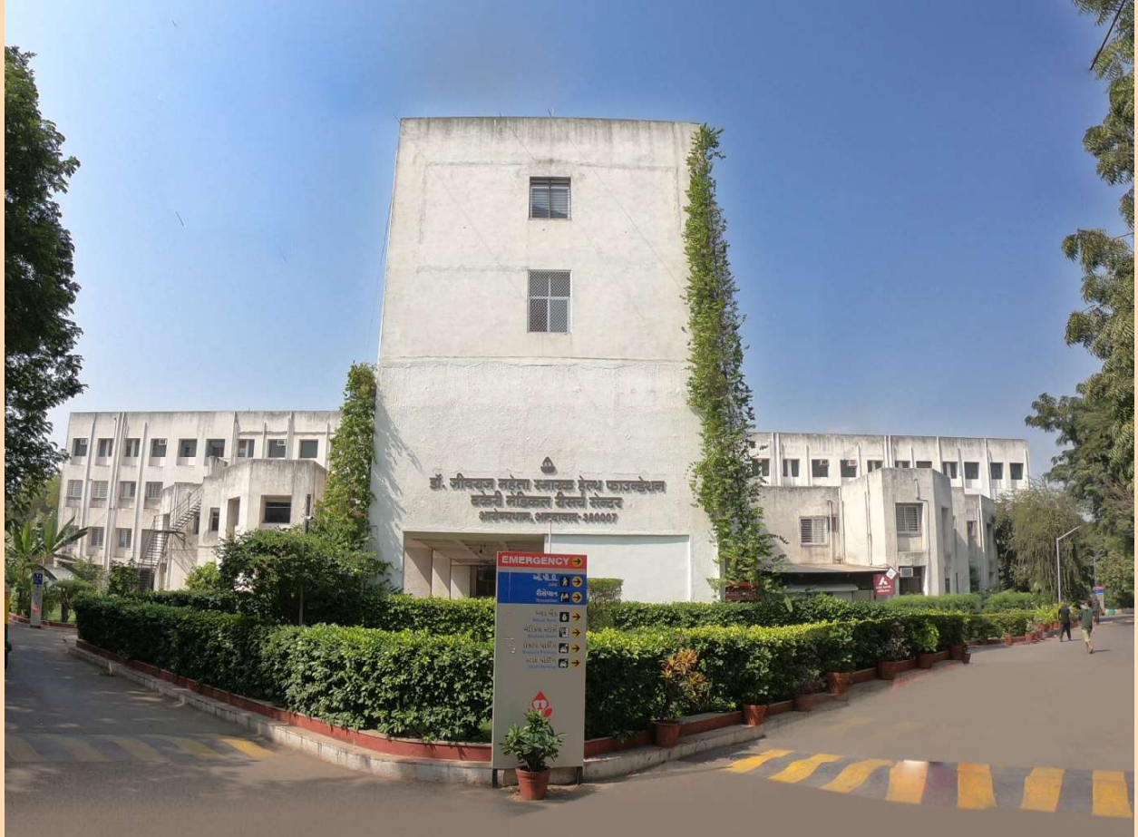
Dr. Jivraj Mehta Smarak Health Foundation Bakeri Medical Research Centre